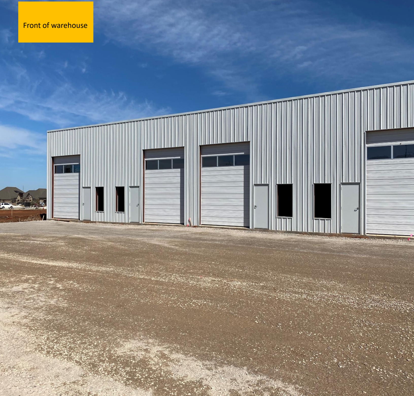
Front of warehouse