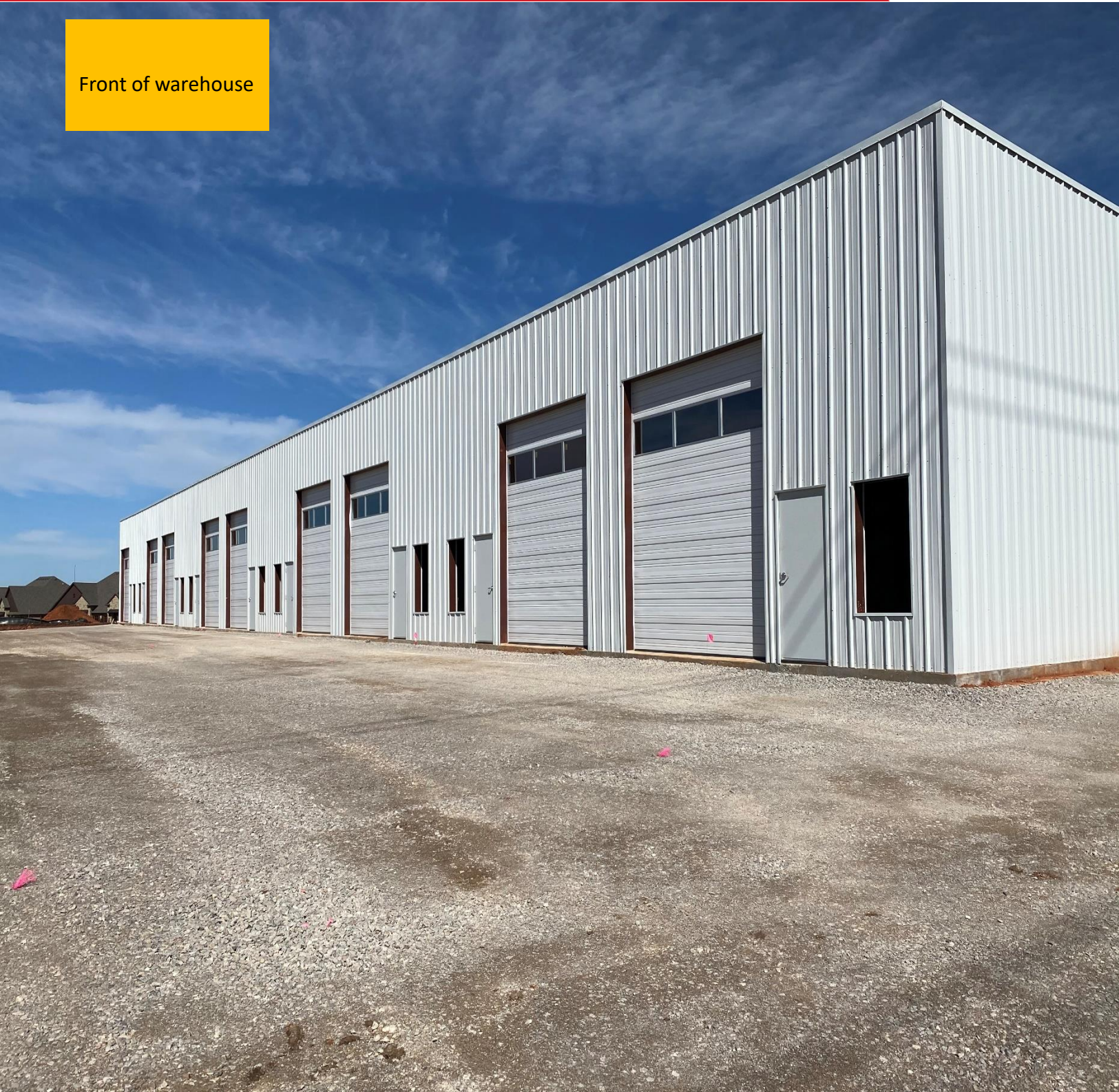
Front of warehouse